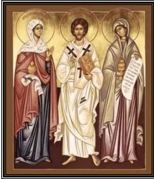
Martha, Mary and Lazarus