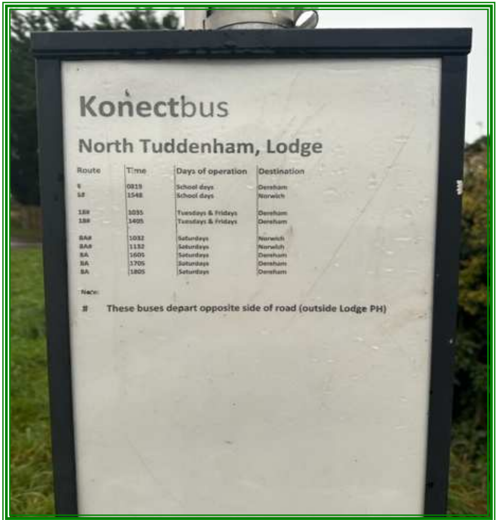
Konnectbus sign outside the Lodge

Relates to services 8, 18 & 8A School Days Tuesdays & Fridays Saturdays