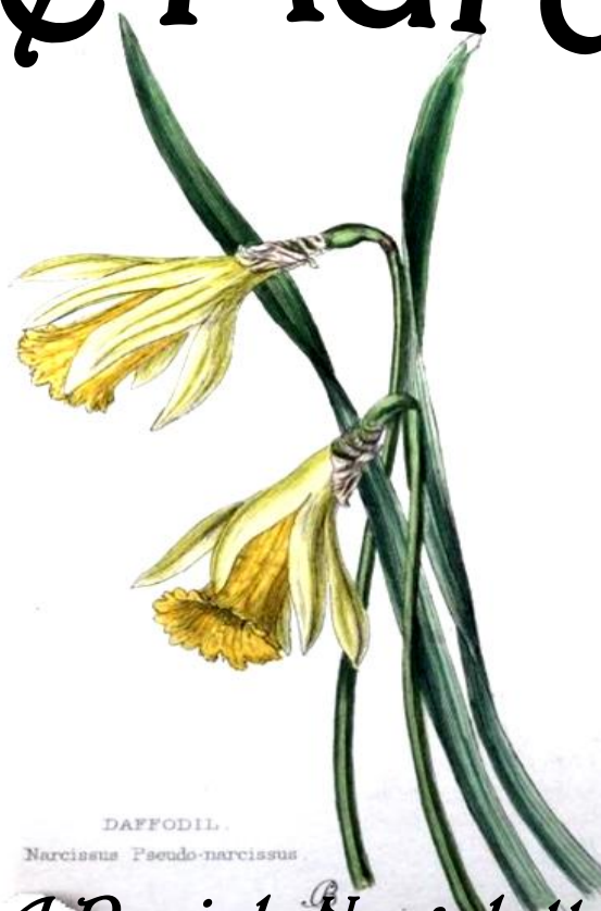
DAFFODIL. Narcissus Pseudo-narcissus.